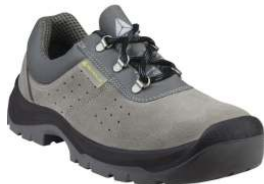
DeltaPlus FENNEC4 S1P SRC