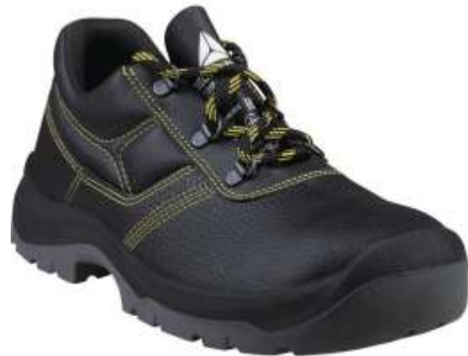
DeltaPlus JET3 S1P SRC