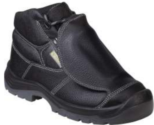
DeltaPlus MIWA S3 M SRC