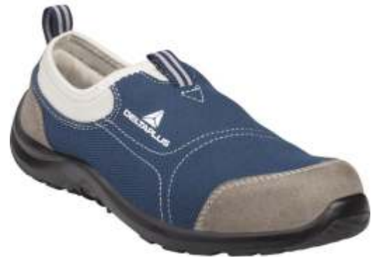
DeltaPlus MIAMI S1P SRC