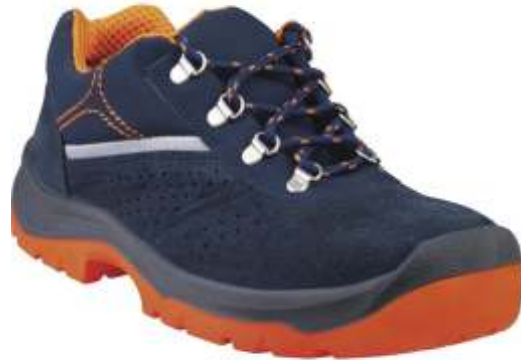
DeltaPlus PHOCEA S3 SRC