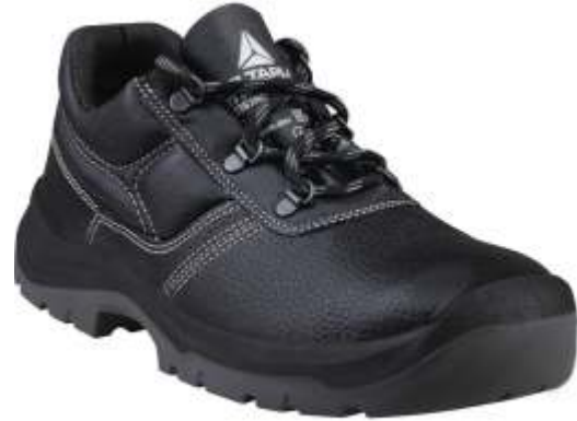
DeltaPlus JET3 S3 SRC