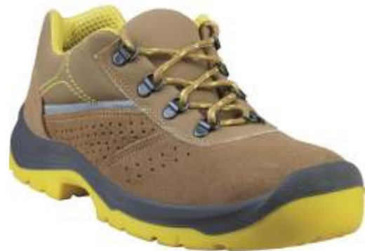
DeltaPlus RIMINI4 S1P SRC