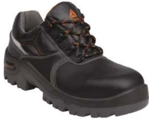
DeltaPlus PHOCEA S3 SRC