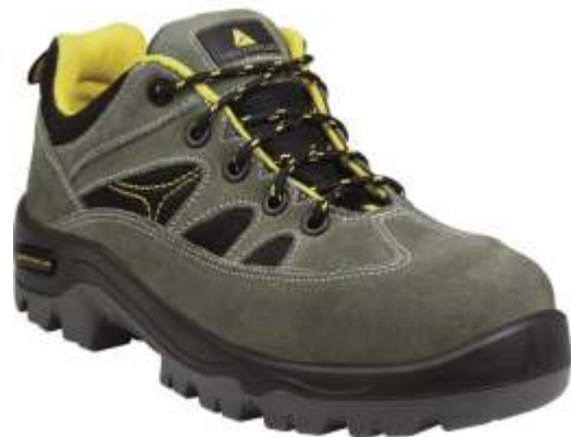
DeltaPlus PERTUIS3 S1P SRC