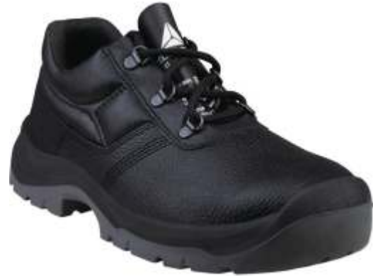
DeltaPlus JET3 S1 SRC