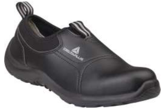
DeltaPlus MIAMI S2 SRC