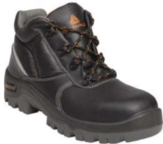
DeltaPlus PHOENIX S3 SRC