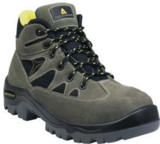
DeltaPus AURIBEAU3 S1P SRC