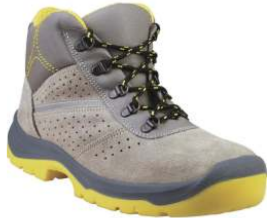
DeltaPlus JUMPER3 S1 SRC