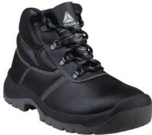
DeltaPlus JUMPER3 S3 SRC