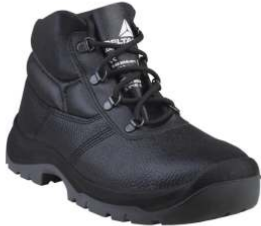
DeltaPlus JUMPER3 S1 SRC