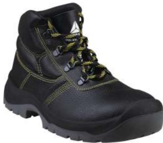
DeltaPlus PHOENIX EH S3 SRC