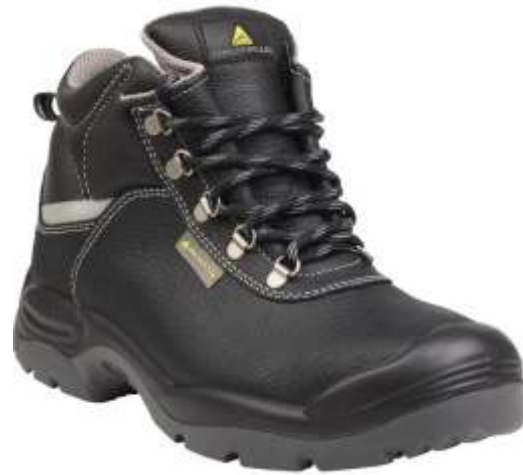
DeltaPlus SAULT2 S3 SRC