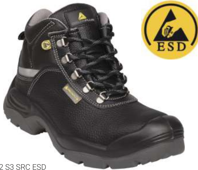
DeltaPlus SAULT2 S3 SRC ESD

SIZE: 39, 40, 41, 42, 43, 44, 45, 46, 47, 48