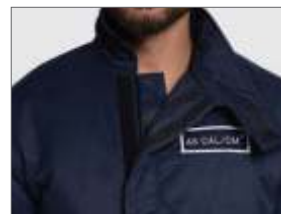
Front closure with zipper and velcro