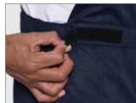
Adjustable waist loop with velcro