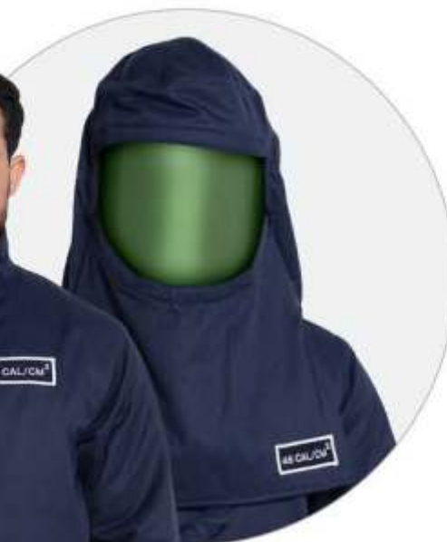
Vallum hood with helmet and visor