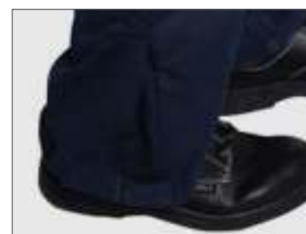
Bottom adjusted with velcro tab